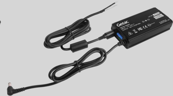
Bare Wire Version