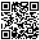
ZX10 3D demo