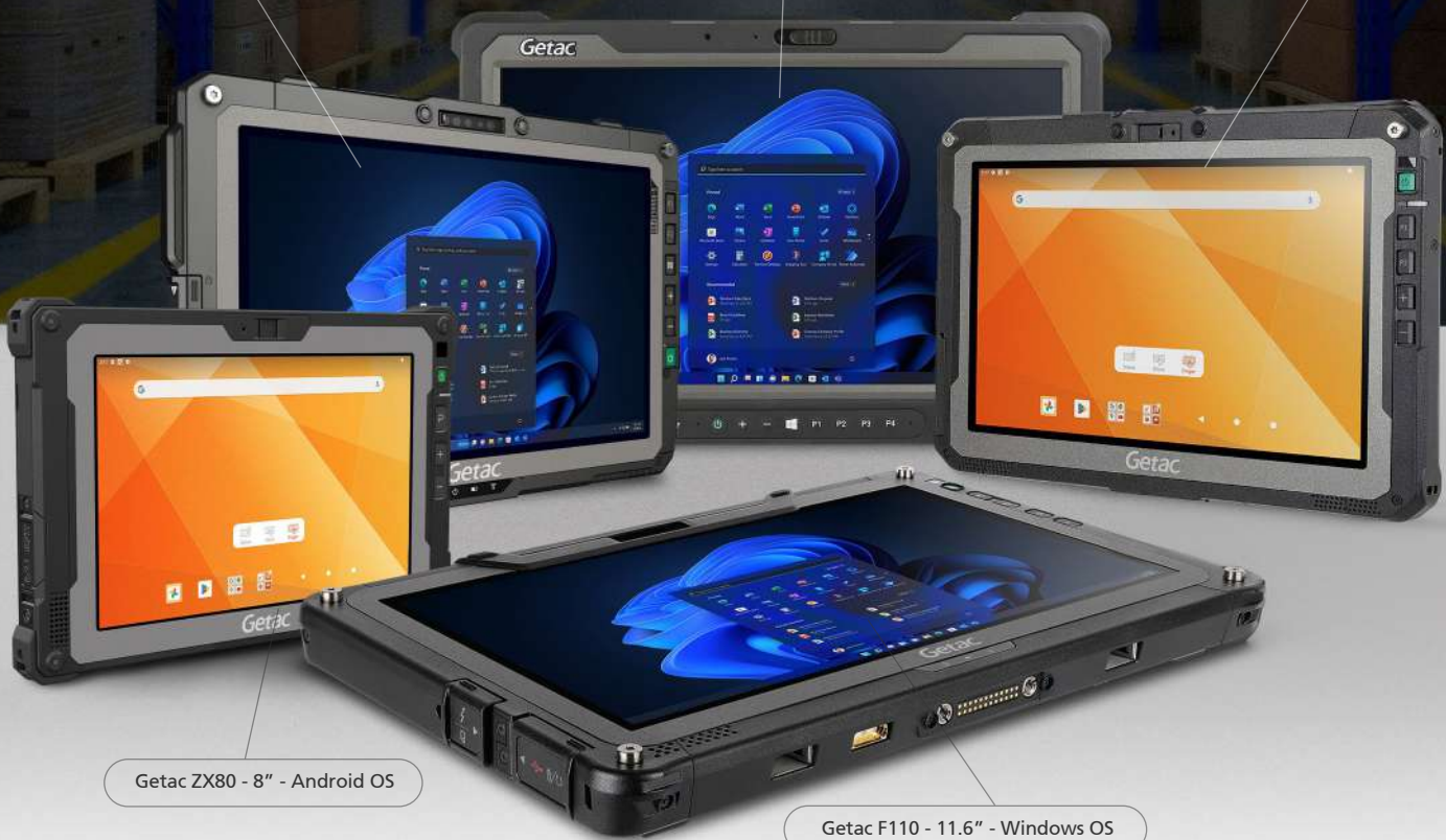
Getac ZX80 - 8" - Android OS