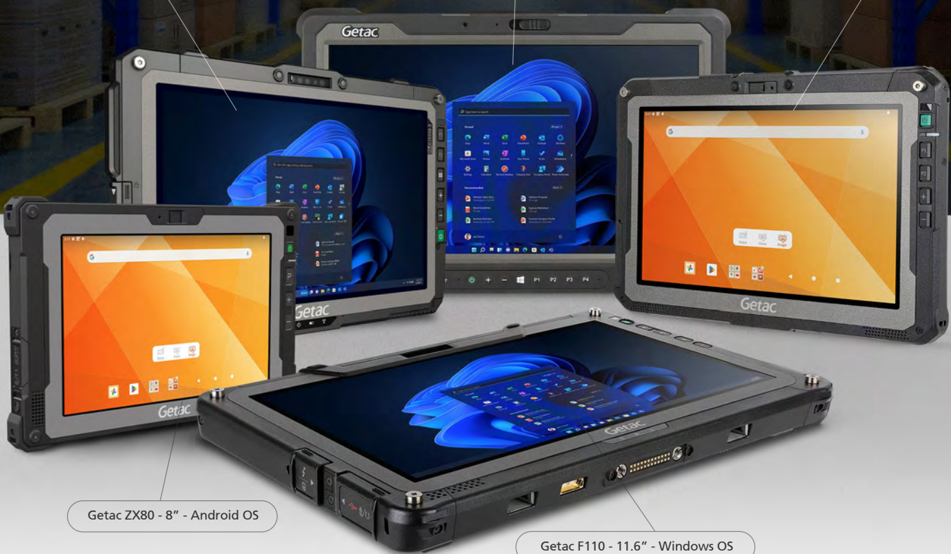
Getac ZX80 - 8" - Android OS