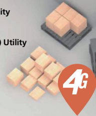
GETAC UX10-EX 3D EXPERIENCE