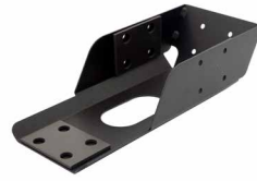
590GBL001271 Pistol Grip Scanner Bracket