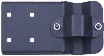
592GUK000023 2", 2.5", 3" Diameter Tube Clamp

Expand your mounting location options by connecting your solution to multiple sizes of cylindrical poles, handles, or tubular style overhead guard legs. Adapt a Clam Shell product to finalize the total solution.