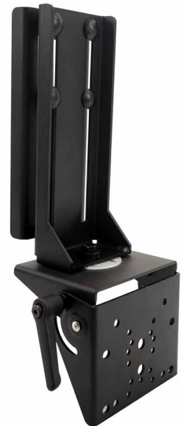
590GBL000333 Tall Overhead Bar Mount