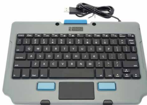
590GBL000608 Rugged Lite Keyboard