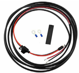
590GBL001270 Wire Harness - 2.5mm DC Power Plug with 10 amp In-line Fuse