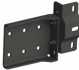
590GBL000773 Toyota Cab Latch Mount for Electronic Hydraulics

Secure your valuable tablets and devices right in the cab of your material handling vehicle using one of our reliable OEM specific mounts. Perfectly suited to tailor your workspace to the most efficient, ergonomic, and secure configuration, all while protecting your valuable assets and lift vehicle operators.