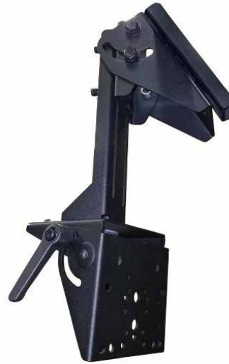
590GBL000651 Tall Adjustable Overhead Guard Bar