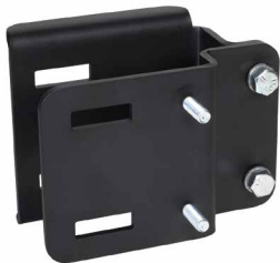
592GUK000020 For Yale/Hyster, Crown, and others

We have the ideal products for every mounting situation; including lift vehicles that have roll formed overhead guard legs. These brackets conform perfectly to various roll formed profiles ultimately creating a solid foundation to adapt our Clam Shell product line.