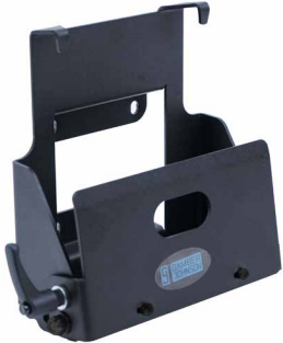
590GBL001277 Datamax O'Neil RL4 Printer Bracket *See website for full assortment

Continue to expand from a desk to a mobile work environment by creating a secure and accessible way to mount rugged mobile printers.