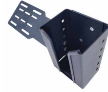
590GBL000387 Scanner Pocket Tablet Mount