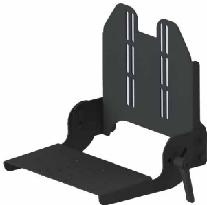
591GUS000016 Tablet Keyboard Mount

Configure your keyboard for ultimate ease of use and the fastest possible access with our large selection of Keyboard Mounts. With an ergonomic angle that meets user needs, working on the keyboard in the field can be more streamlined and reliable than ever before.