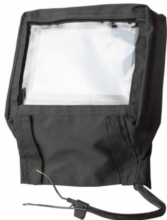
590GBL000216 - 8" Protective Cover 590GBL000172 - 10" Protective Cover 590GBL000074 - 8" Thermal Protective Cover 590GBL000217 - 10" Thermal Protective Cover

Encase your device with Gamber-Johnson's patented selection of thermal and non-thermal protective covers. Designed to keep your device safe from the harsh elements in unforgiving work environments that could prematurely destroy your assets.