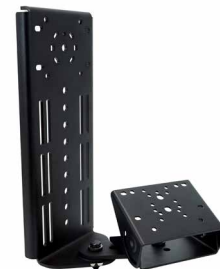
590GBL000073 Low Profile Tablet Keyboard Bracket