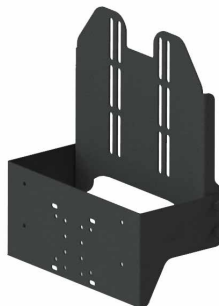
590GBL000876 Vertical Tablet Keyboard Mount