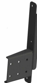
590GBL000322 Yale/Hyster Electric Bracket