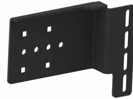
590GBL000774 Toyota Cab Mount