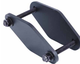
590GBL000327 Power Supply Clamp