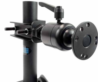
590GBL000389 Zirkona 3/4" to 1 7/8" Pole Mount with VESA 75mm Mounting Plate