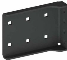
590GBL000161 Clamp Bracket Adapter