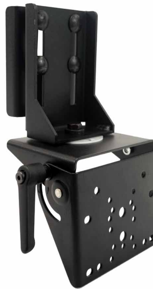
590GBL000231 Short Overhead Bar Mount