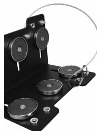
590GBL001275 TYRI Redline Light Mount