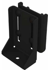
590GBL001274 Single Light Bracket

Mount safety lights to present a visual alert to help increase warehouse safety, minimize the risk of accidents, and improve visible awareness of approaching lift vehicles.