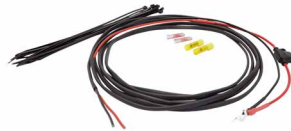
590GBL000513 Wiring Kit