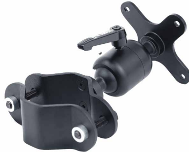
590GBL000388 Zirkona 2" to 3" Pole Mount with VESA 75mm Mounting Plate