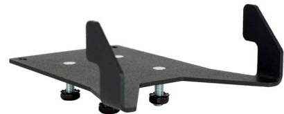
590GBL001279 Zebra ZQ620 Printer Bracket