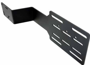
590GBL000650 Number Pad Bracket