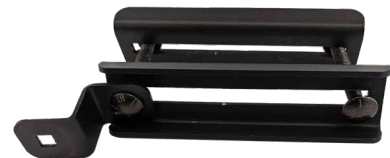
590GBL001276 Forklift Light Mount