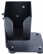
590GBL001272 Flat Surface Magnet Mount with Scanner Holder