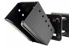
590GBL001273 Scanner Pocket Mount with Small Back Plate