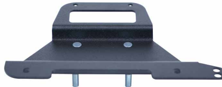
590GBL001278 Zebra ZQ630/QLN420 Printer Bracket