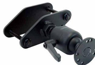
590GBL001269 Zirkona 4" Diamond Plate with Large Joiner and AMPS/NEC Plate

When it comes to mounting lightweight devices turn to Gamber-Johnson's diamond plate mounts for a reliable solution. Multiple product offerings to interface your device with various hole patterns and ample adjustability to accommodate operator comfort and ease of use.