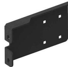
590GBL001264 Linde E30 Latch Mounting Bracket