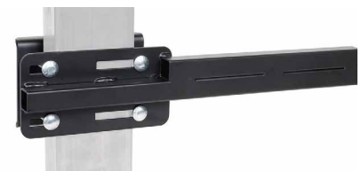
590GBL000651 Horizontal Extension Bar

Increase your usable mounting space with our horizontal extension giving you more room to mount a total solution. Compatible with all Gamber-Johnson's roll formed and tube clamp brackets to ensure secure fitment to any overhead guard leg profile.