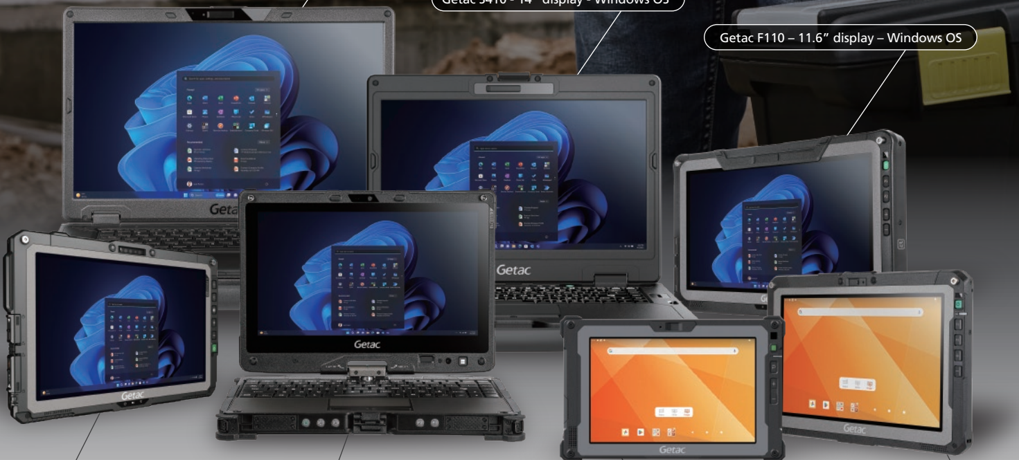
Getac UX10 - 10.1" display - Windows OS